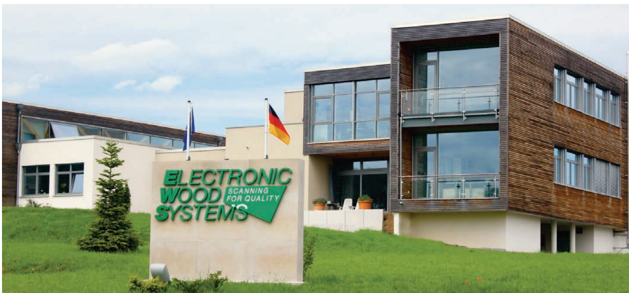
Above: The Hamelin base of EWS

Mr Solbrig said the trend of customers unwilling to stop production lines in