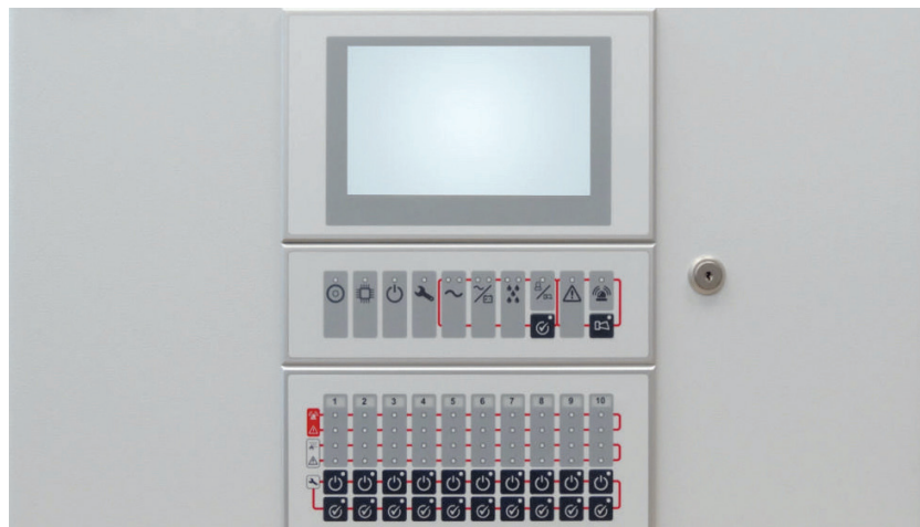
Above: Spark detection and extinguishing system

EWS' distribution partner in China – Beijing Euro-China – has already ordered for 2022 and will receive three shipments of spark detection components for sale during the year. "This is fantastic, you can plan all these things in the production much better if you get the orders already," added Mr Kleinschmidt. ●