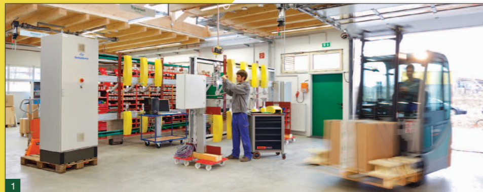
Photo 1-3: The EWS headquarters in Hameln, Germany, accommodates space for its growing family and production capacity.