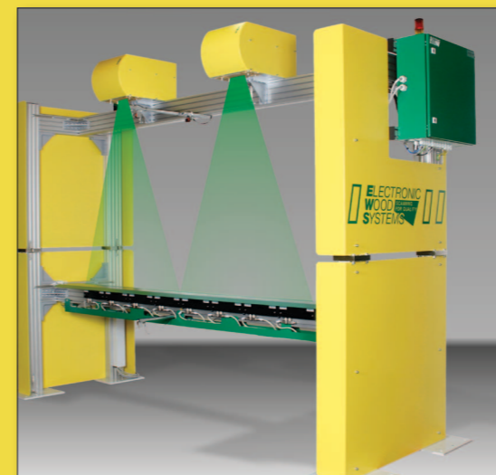
EWS Non-contact weight scale CONTI-SCALE X using X-ray evaluates the area weight distribution of the final board