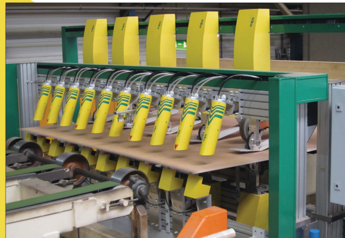
EWS blow detection and thickness gauge system installed on a panel line